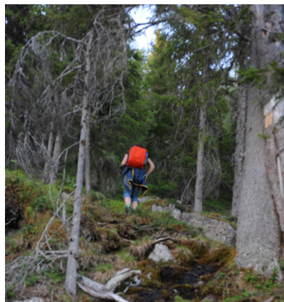
The trail is really steep in places. It gets slippery after rain.