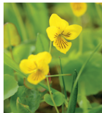
Arctic yellow violet Viola biflora