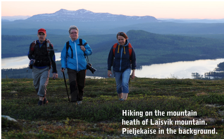
Hiking on the mountain heath of Lájsovárre. Pieljekaise in the background.

Path: The beginning is well visible from N Laisvik and the ascent starts almost immediately.