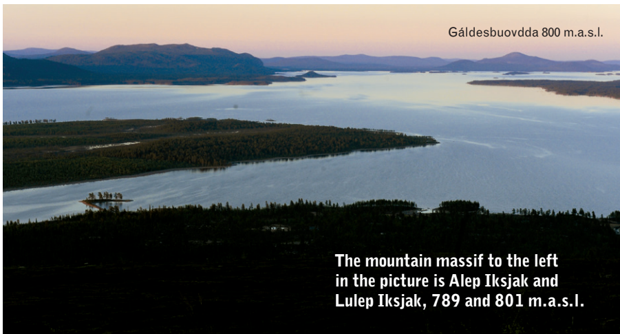
Gáldesbuovdda 800 m.a.s.l.

The mountain massif to the left in the picture is Alep Iksjak and Lulep Iksjak, 789 and 801 m.a.s.l.