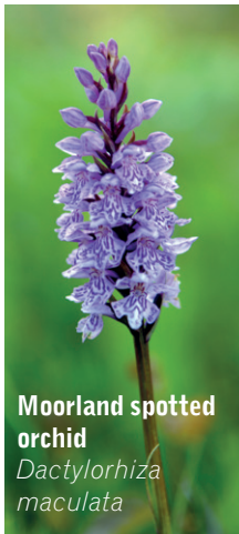
Moorland spotted orchid Dactylorhiza maculata