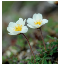
Mountain avens Dryas octopetala