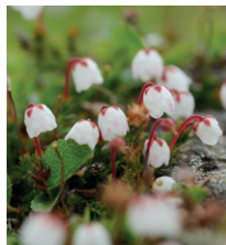
Mossljung Cassiope hypnoides