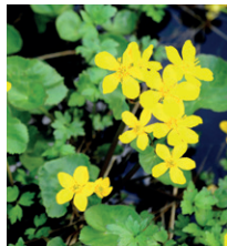
Kingcup Caltha palustris