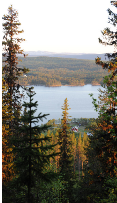
Halfway up you can glimpse the village Laisvik with a northern and southern part.

Animals: Wood grouse, hazel grouse, willow grouse, golden eagle, various falcons, fox, hare, elk and reindeer are the most common animals. Most likely you will see – and hear – golden plover. Lynx and marten move along the slopes, but are very rarely seen by hikers.