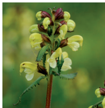
Lapland lousewort Pedicularis lapponica