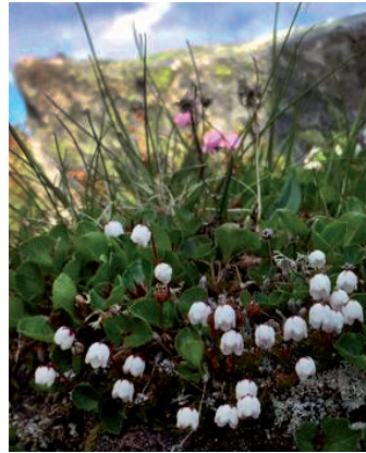
Marsh grass Parnassia palustris