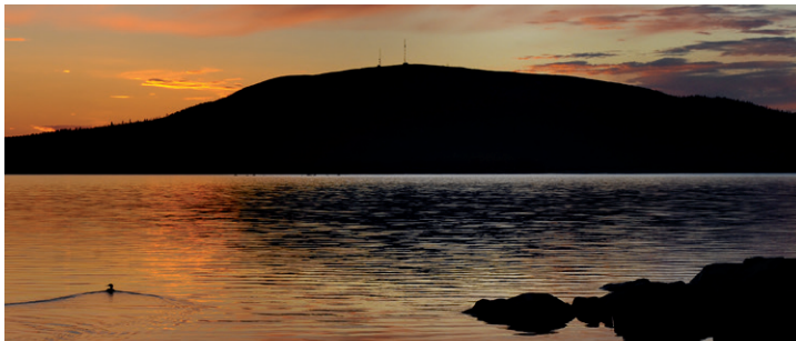
Gáldesbuovdda with its nature reserve. During winter it's a ski resort with caravan pitches and a hotel.

Shelter: There is none at the top, but 200 m further down the paved road there is a large cabin with seating. An information board presents the Galtispuoda nature reserve.