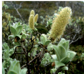
Grey willow Salix cinerea