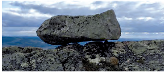
Near the top of Alep Iksjåk there is a so-called 'laying hen', a boulder perched on three smaller rocks. Artwork courtesy of the inland ice.

Birds: There are golden eagles and rough-legged buzzards in the area, but more commonly seen are Siberian jay, golden plover and dotterel. Other species found to a greater or lesser extent are mountain finch, bluethroat, willow grouse, redpoll, willow warbler, redstart and redwing.