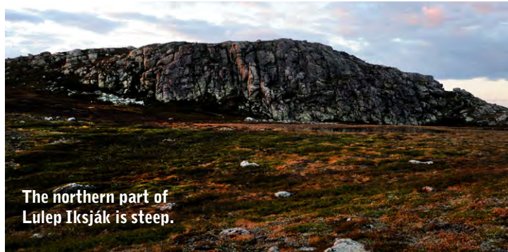
The northern part of Lulep Iksjåk is steep.

The area around the top is full of exciting formations. The inland ice melted, carved through and polished the mountain chain with enormous power. There is a steep side to Lulep Iksjåk that is constantly changing. It's known as frost blasting, common in cold regions and high mountain ranges. Water penetrates cracks that expand as it freezes into ice. When water freezes, it becomes nine percent 'bigger'. If you were to take a picture of the mountain top now, and another one in fifty years' time, you would probably see the change.