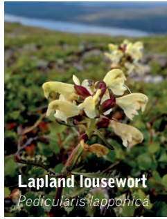
Lapland lousewort Pedicularis lapponica

Flowers: In early summer you can see kingcup and globeflower – often near wetlands. On the mountain slopes you can spot yellow mountain saxifrage, pincushion plant, purple mountain saxifrage, hairy lousewort, Arctic yellow violet, alpine bistort, snow gentian, purple mountain heather, twinflower and Lapland lousewort. In late summer, the statuesque northern wolfsbane and alpine sow-thistle take over.