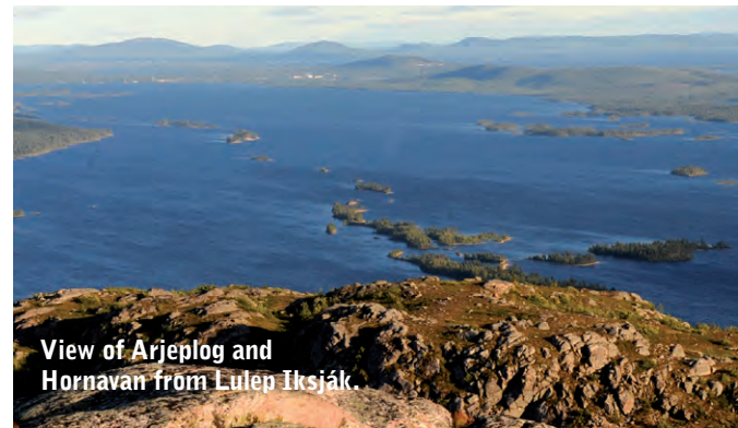
View of Arjeplog and Hornavan from Lulep Iksjåk.

Plenty of twin flowers, Linnaea borealis , grow on the moss-clad slopes in metre-long tendrils. It was Carl Linnaeus's favourite flower and he was often portrayed with a twin flower in his hand. It was also featured on his coat of arms.